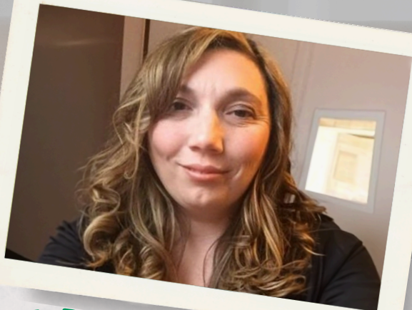
Charlotte Center Executive Director